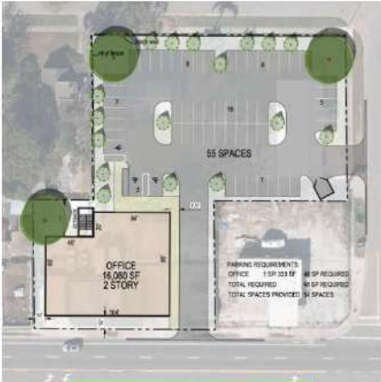
Two-story, 16K SF Office