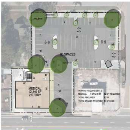
Two-story, 12K Medical