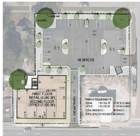
Two-story, 16K retail/office